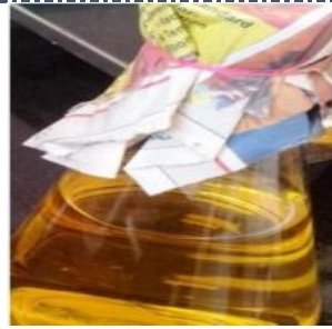
Fig 1: Solution without bacteria (only media)